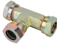
Equal Tee N.B. Tube