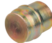
Blanking Plug O.D. Tube