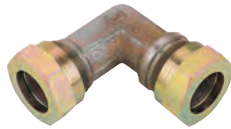
Equal Elbow N.B. Tube