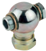
BSPP Banjo Coupling N.B. Tube