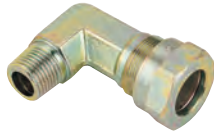
BSPT Male Stud Elbow N.B. Tube