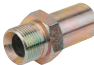
BSPP Stud Standpipe Adaptor N.B. Fitting