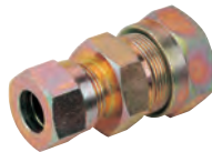
Reducing Coupling O.D. Tube