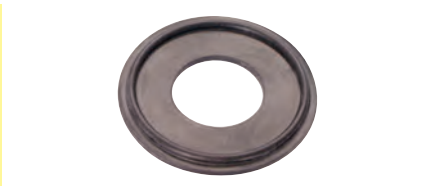
Clamp Seal, EPDM