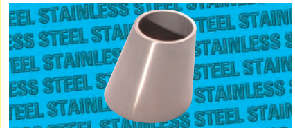
Plain Eccentric Reducers