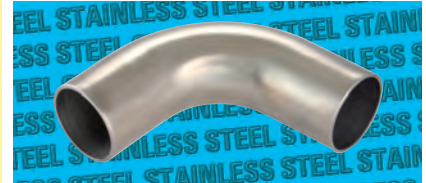
Plain 90° Bends Short