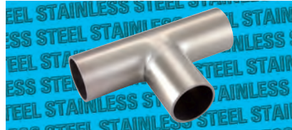
Plain Tees Long