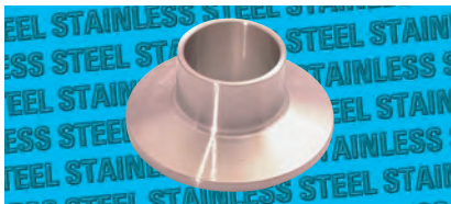
Clamp Welding Ferrules