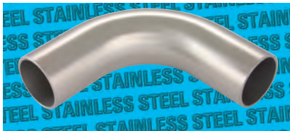
Plain 90° Bends Long