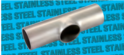
Plain Tees Short