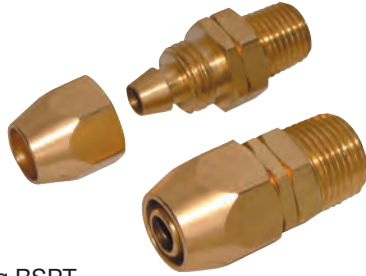
Brass Fitting BSPT

Other fittings can be used with "Flexi-Braid" Hose, such as Brass Hose-Tails (see page 817) Stainless Steel Hose Tails (see page 839) or Nylon Hose Tails, (see page 964).