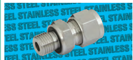
Male Thread, SAE/MS (Captive Seal)