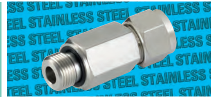
Male Thread, SAE/MS (Long)