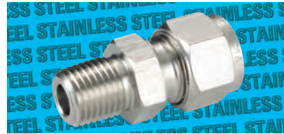
Male Thread, BSPT