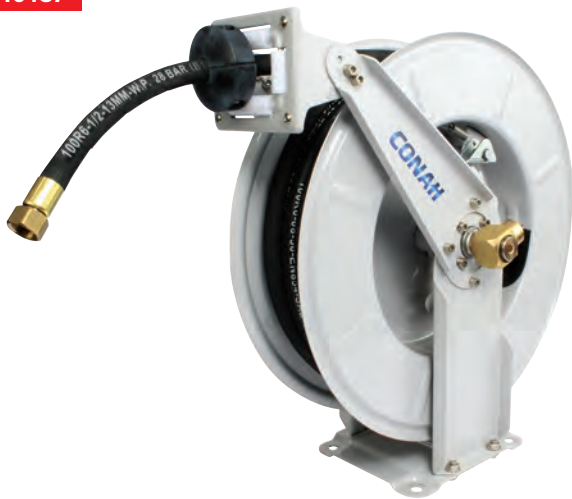
R6, Spring Rewind, 1/2"