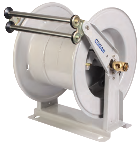
Spring Rewind, 3/4"