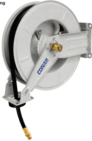
Rubber Air Hose, Spring Rewind, 1/2"