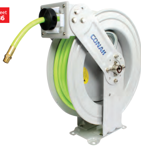
Hi-Vis, Spring Rewind, 1/2"