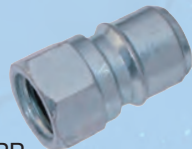
Female Probe, BSPP