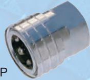
Female Carrier, BSPP

Interchangeable with: Nito High Pressure Water Coupling 40 Series Water Coupling