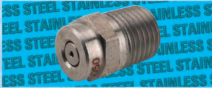
Stainless Steel, 1/4" BSPT Male

Stainless Steel 1/4" Male thread with a hardened steel insert for longer life and better accuracy, suitable for single and double lances.