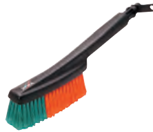
Hand Waterfed Brushes