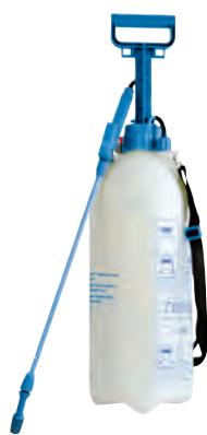
8 Litre Pressure Sprayer