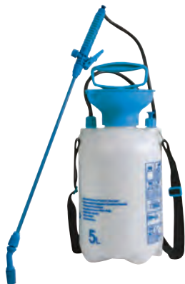
5 Litre Pressure Sprayer