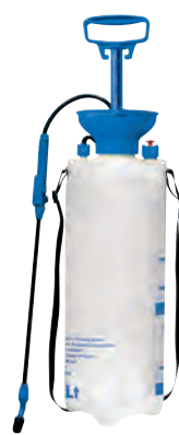
10 Litre Pressure Sprayer