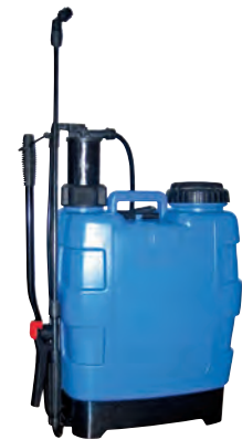
20 Litre Backpack