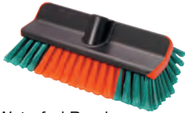
Hi-Lo Waterfed Brush

The shape design gives more cleaning productivity, as the brush is in constant contact with the surface, when used as either a waterfed or a dip brush.