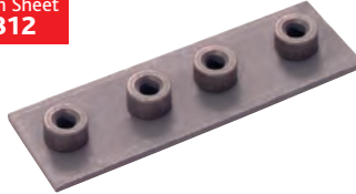
Twin Weld Plate, Steel