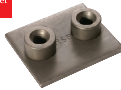
Multiple Weld Plate, Steel