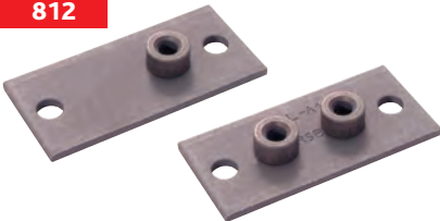
Weld/Screw Plate, Steel