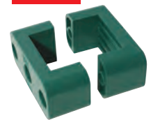
Series A Sensor Clamps