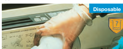
Ansell 34-500 Dura-touch Glove, Clear