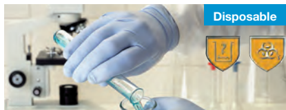
Ansell 92-670 TNT Glove, Powder Free, Blue