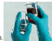
Ansell Touch N Tuff Gloves, Green