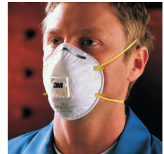
3M 8812 Cup Shape Valved Dust Respirator

Approved to EN 149:2001 FFP1. Nominal Protection Factor 4. Assigned Protection Factor 4.