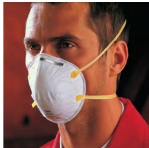
3M 8710E Cup Shape Dust Respirator

Approved to EN 149:2001 FFP1. Nominal Protection Factor 4. Assigned Protection Factor 4.