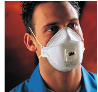
3M 9312 Foldable Valved Dust Respirator

Approved to EN 149:2001 FFP1. Nominal Protection Factor 4. Assigned Protection Factor 4.