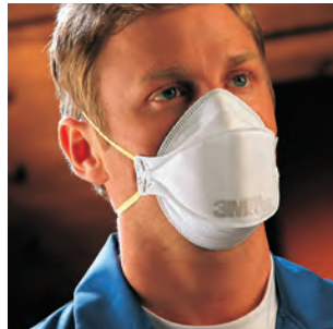
3M 9310 Foldable Dust Respirator

Approved to EN 149:2001 FFP1. Nominal Protection Factor 4. Assigned Protection Factor 4.