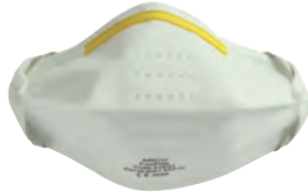
Freeflow FFP1 Dust Respirators