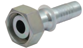
Female, 24° Seat