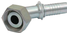
45° Female Elbow, 24° Seat