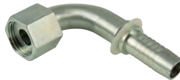
ORFS Female 90° Elbow Insert