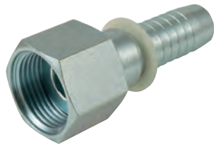
ORFS Female Insert