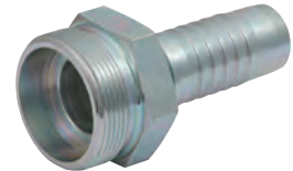
Male, 24° Seat