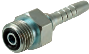
ORFS Male (O-Ring Face)