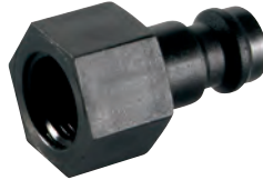
Female Thread, BSPP, RectuPom