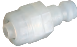
Quick Fit Tube Connection, RectuChem