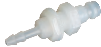
Panel Mount Hose Connection, RectuChem