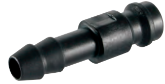
Hose Tail, RectuPom