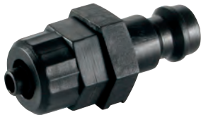
Quick Fit Tube Connection, RectuPom