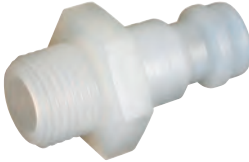
Male Thread, BSPP, RectuChem