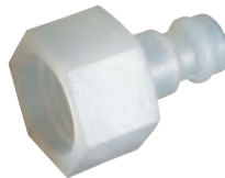
Female Thread, BSPP, RectuChem