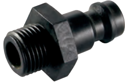
Male Thread, BSPP, RectuPom