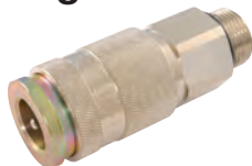
Male Thread, BSPP