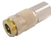
Female Thread, BSPP