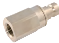
Female Thread, BSPP