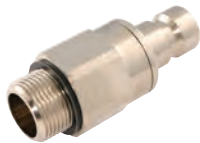
Male Thread, BSPP