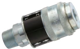
Male Thread, BSPT