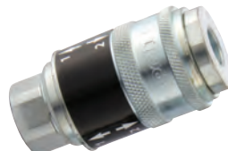
Female Thread, BSPP