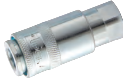
Female Thread, BSPP