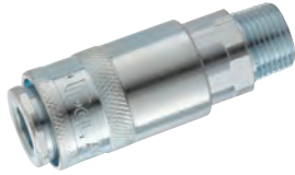
Male Thread, BSPT