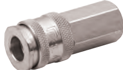
Female Thread, BSPP