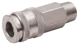
Male Thread, BSPT