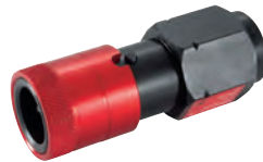
Combined Female with Self Sealing Valve, Emergency