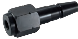
Combined Male with Self Sealing Valve, Service