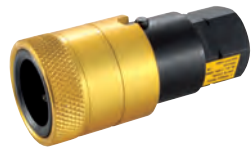
Female with Lift Valve, Service