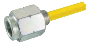
Self Sealing Valve