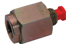
Self Sealing Valve for C or CA Coupling