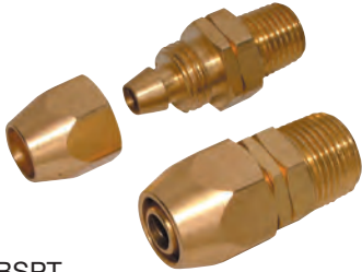
Brass Fitting BSPT

Other fittings can be used with "Flexi-Braid" Hose, such as Brass Hose-Tails (see page 817) Stainless Steel Hose Tails (see page 839) or Nylon Hose Tails, (see page 964).