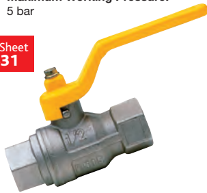
Type BV70, Female x Female, Lever Handle, BSPP