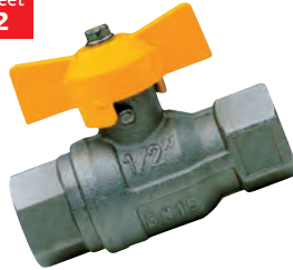
Type BV72, T Handle, Female x Female, BSPP