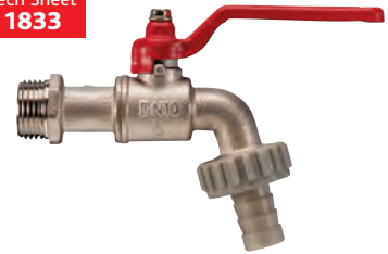
Type BV174, Male x Hosetail, BSPP