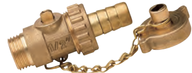
Tank Filling & Emptying Ball Cock, BSPP