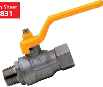
Type BV71, Male x Female, Lever Handle, BSPP