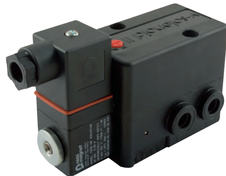
Intrinsically Safe, 1/4: BSPP