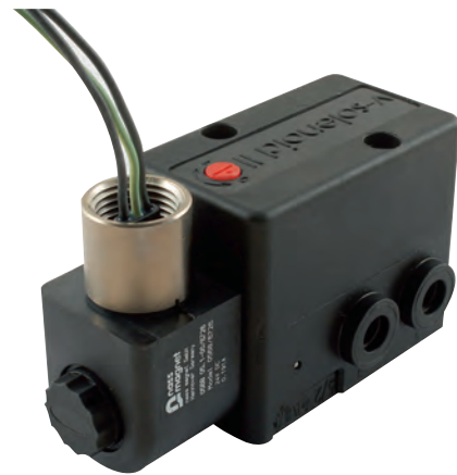
Explosion Proof, 1/4" BSPP