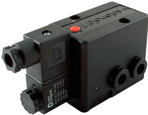
Standard, 1/4" BSPP