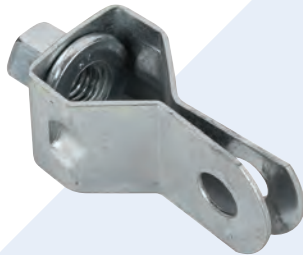
Universal Beam Suspender