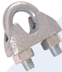
Wire Suspension Clamp

For use with the wire rope turn buckles.