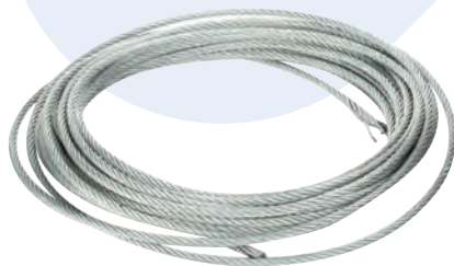
Wire Suspension Cable