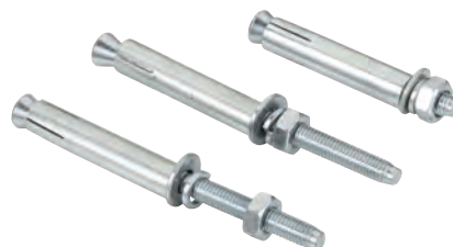
Wall Expansion Bolts

For use with square steel & wall mounted brackets.