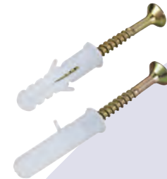
Self Tap Screws