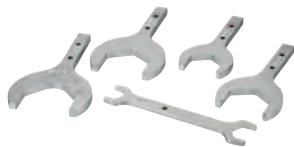
Male Thread Fitting Spanner