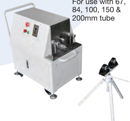
Portable Pipe Lugging Machine

For use with 67, 84, 100, 150 & 200mm tube