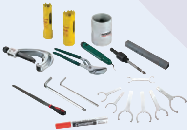
Complete Assembly Tool Kit