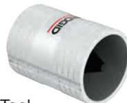
Pipe Deburring Tool