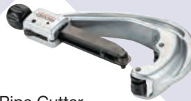
Aluminium Pipe Cutter