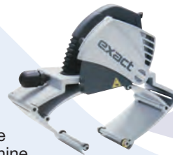
Portable Pipe Cutting Machine