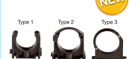
Black PP Clips