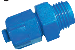
Male Stud, BSPT