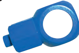
Single Banjo Body, BSPT