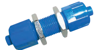
Connectors, 2 x Locknuts, Metric