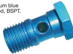
Banjo Bolts, BSPT