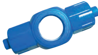
Twin Banjo Body, BSPT