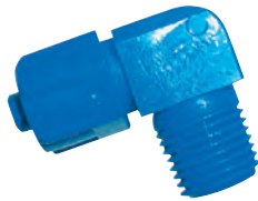
Male 90°, BSPT