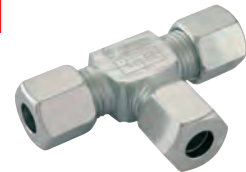
Ball Seat, Light Duty