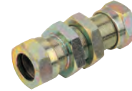
Bulkhead Coupling O.D. Tube